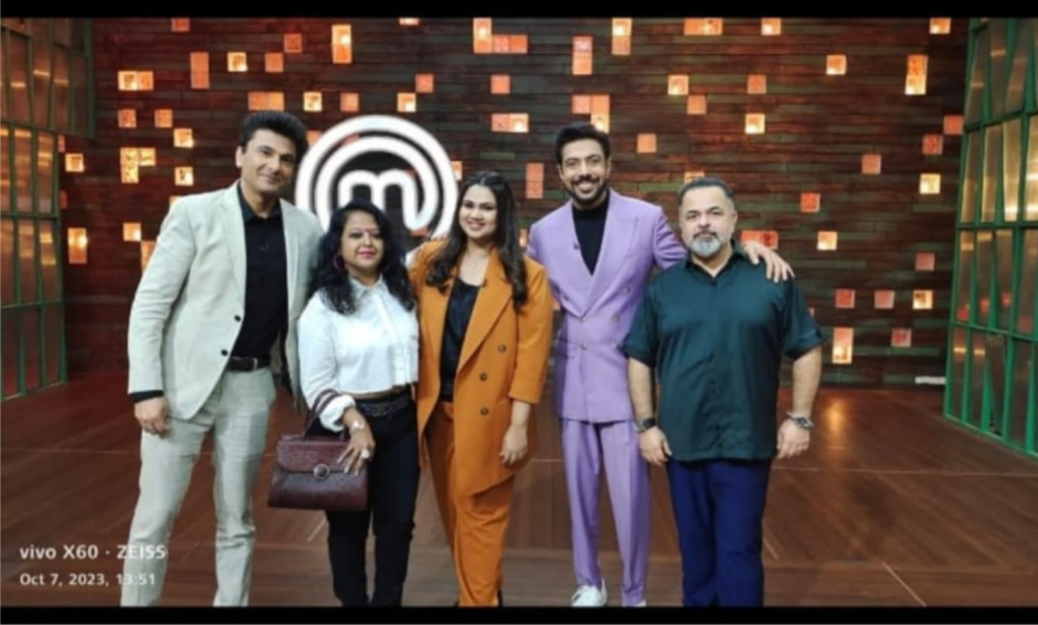
vivo X60 · ZEISS Oct 7, 2023, 13:51