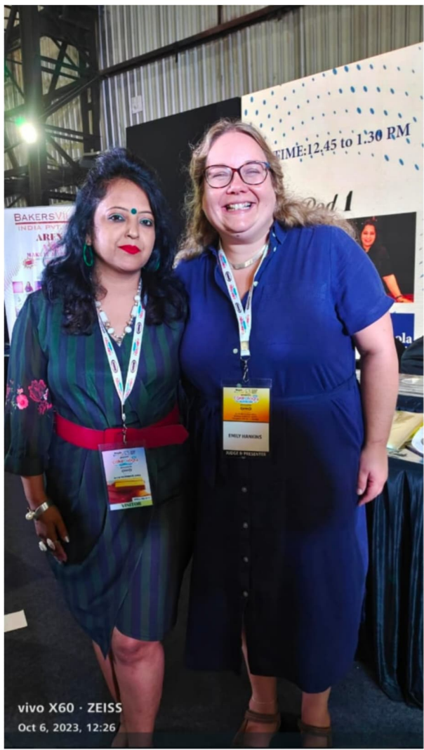
vivo X60 - ZEISS Oct 6, 2023, 12:26