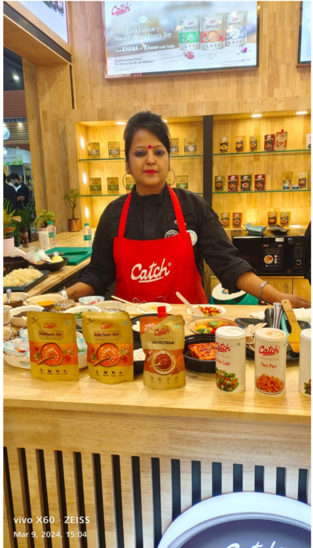
vivo X60 · ZEISS Mar 9, 2024, 15:04